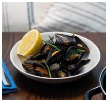
Fresh seasonal seafood, at Salty's