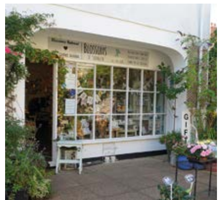
"Much more than a flower shop" - Blossoms