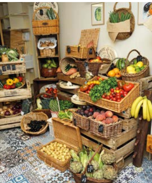
A Harrods Food Hall in the centre of Yarmouth, at Yarmouth Deli