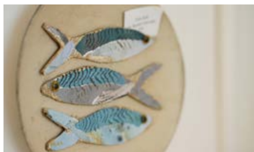
Art for all tastes, at Yarmouth Gallery