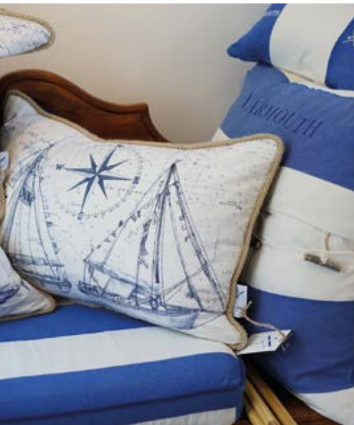
Laid back coastal living at XV Stripes