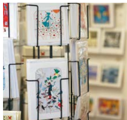
Art greeting cards, at Yarmouth Gallery

Hugely popular with visitors and locals alike, Anne Toms' Yarmouth Gallery is a delightful collection of paintings, ceramics, glassware, textiles, fine art prints, sculpture and photography – meaning that, you guessed it, there's something for everyone, from modern mixed media to traditional methods and materials, with plenty of coastal and nautical influences which speak to its location. Rather impressively, you'll also find a huge range of art greeting cards on offer, the gallery having recently reached the finals of the UK Greeting Cards Retailers Awards.