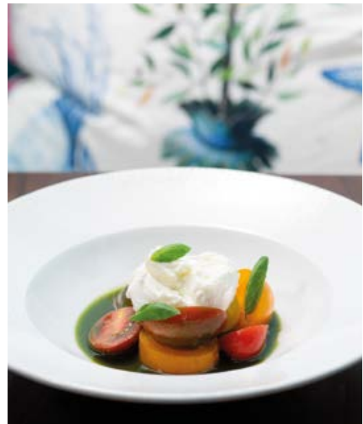
Fine dining returns to West Wight institution Salty's