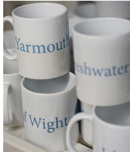
From cocktail sticks to sails, at Harwoods of Yarmouth

restaurant and celebrity hotspot, now freshly refurbished following a devastating fire earlier this summer and ready to make its return to the Isle of Wight fine dining scene. Inside, the building – which was once a garage to The George Hotel, is positively gleaming (think cool white leather benches, ocean-deep linen and sea blue panelling) at the prospect of welcoming old friends and new converts to witness its exciting new chapter. Under new ownership and scheduled for opening at the end of September, Salty's dream team comprises Head chef Tom Axford (of The George fame), Sommelier & Restaurant Manager Phil Wilson (of